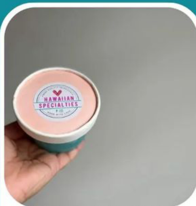
Strawberry Ube Icecream