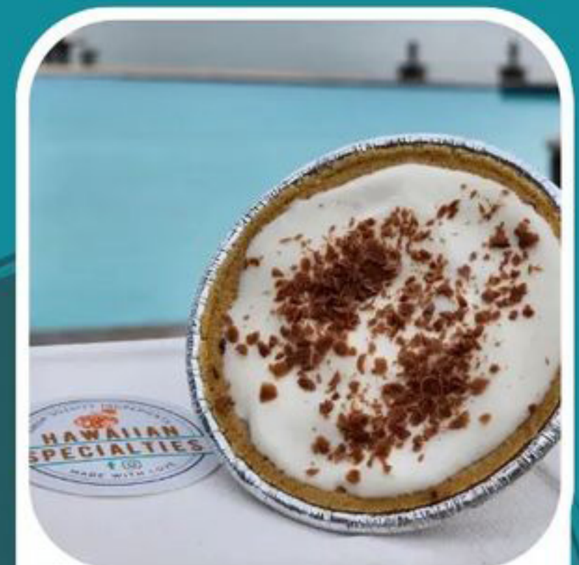
Chocolate Haupia Pie