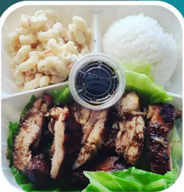
Ono BBQ Chicken