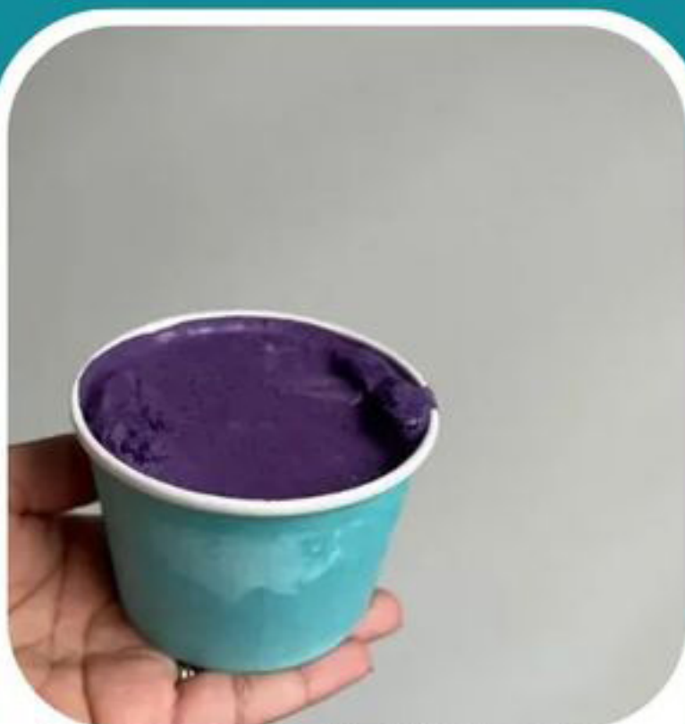
Cookies & Krumbs Ube Icecream