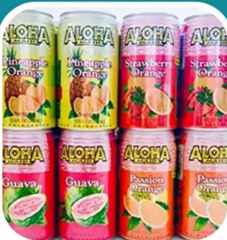
Aloha Maid Drinks