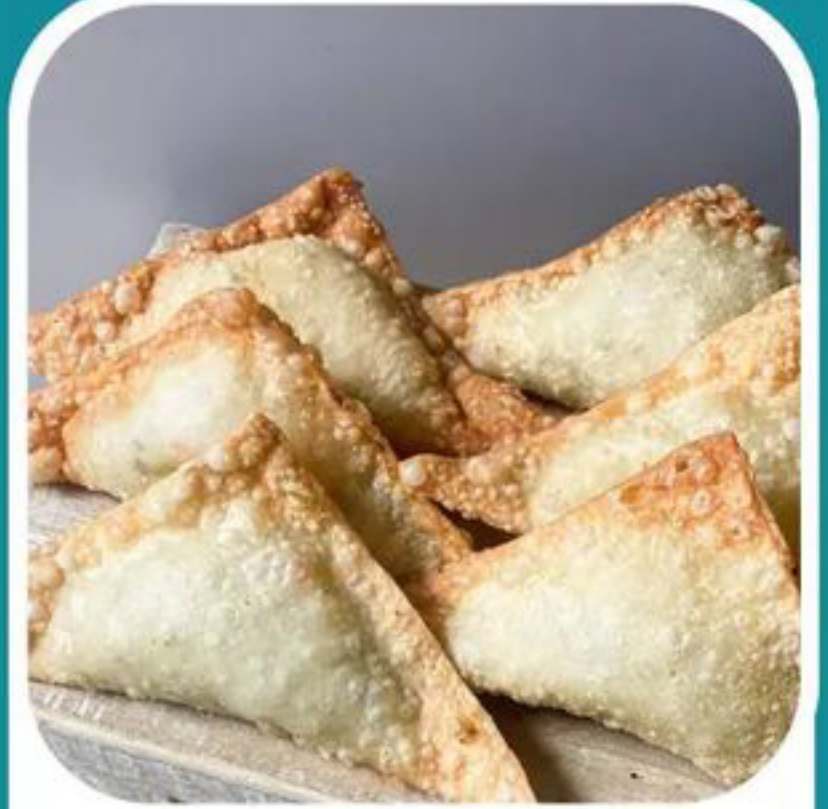
Jalapeño Crab Rangoons