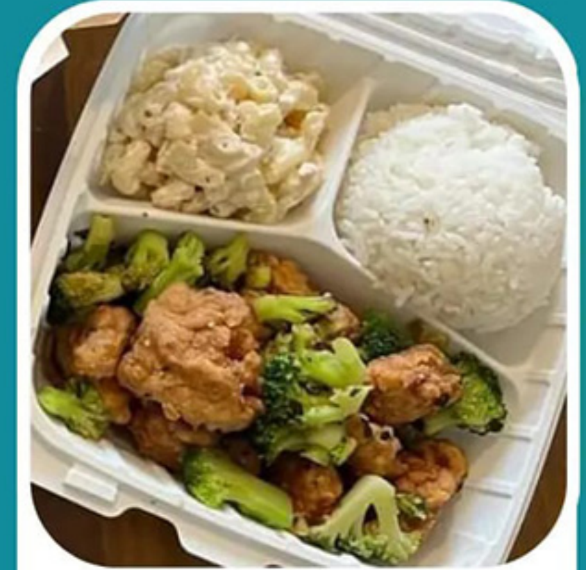
Garlic Chicken & Broccoli