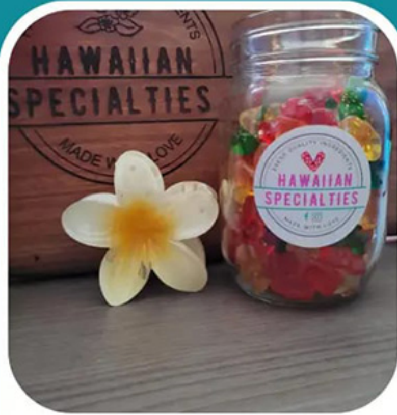
Li-Hing Mui Gummies